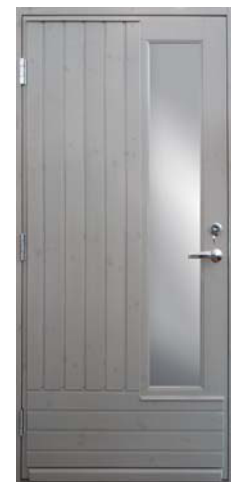
A stained external door made of knotted pine