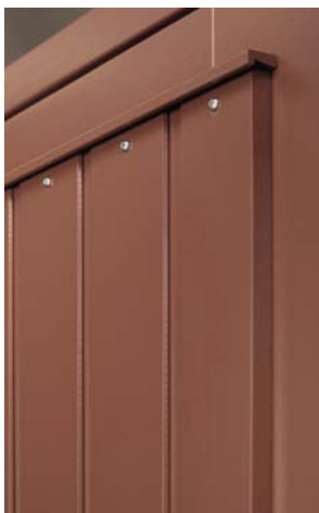
The top of the profile blanking is covered with a timber