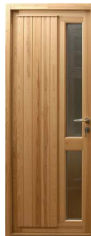
A stained external door made of